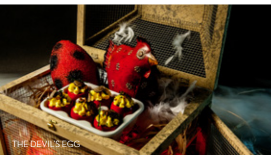
THE DEVIL'S EGG

Current state sales tax 9% and gratuity 20% not included. Menu items are subject to change; restaurant reserves the right to substitute menu items. Pricing valid until December 31, 2018.