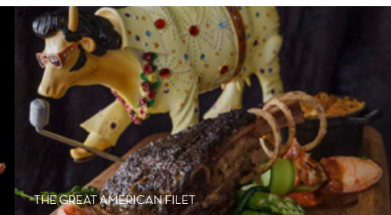
THE GREAT AMERICAN FILET