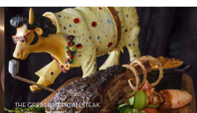
THE GREAT AMERICAN STEAK