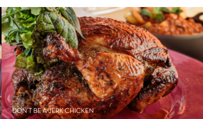
DON'T BE A JERK CHICKEN