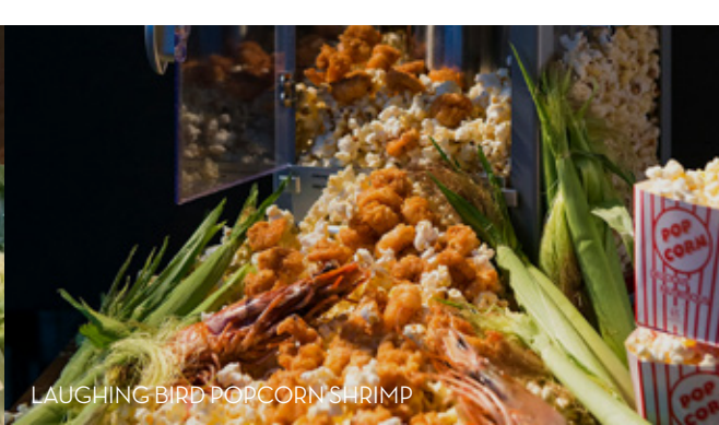
LAUGHING BIRD POPCORN SHRIMP